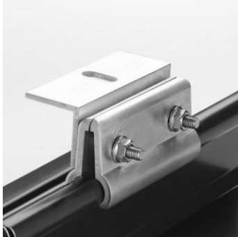
Solarholder 110 mm for round-head seam